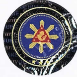
RODRIGO ROA DUTERTE President of the Philippines